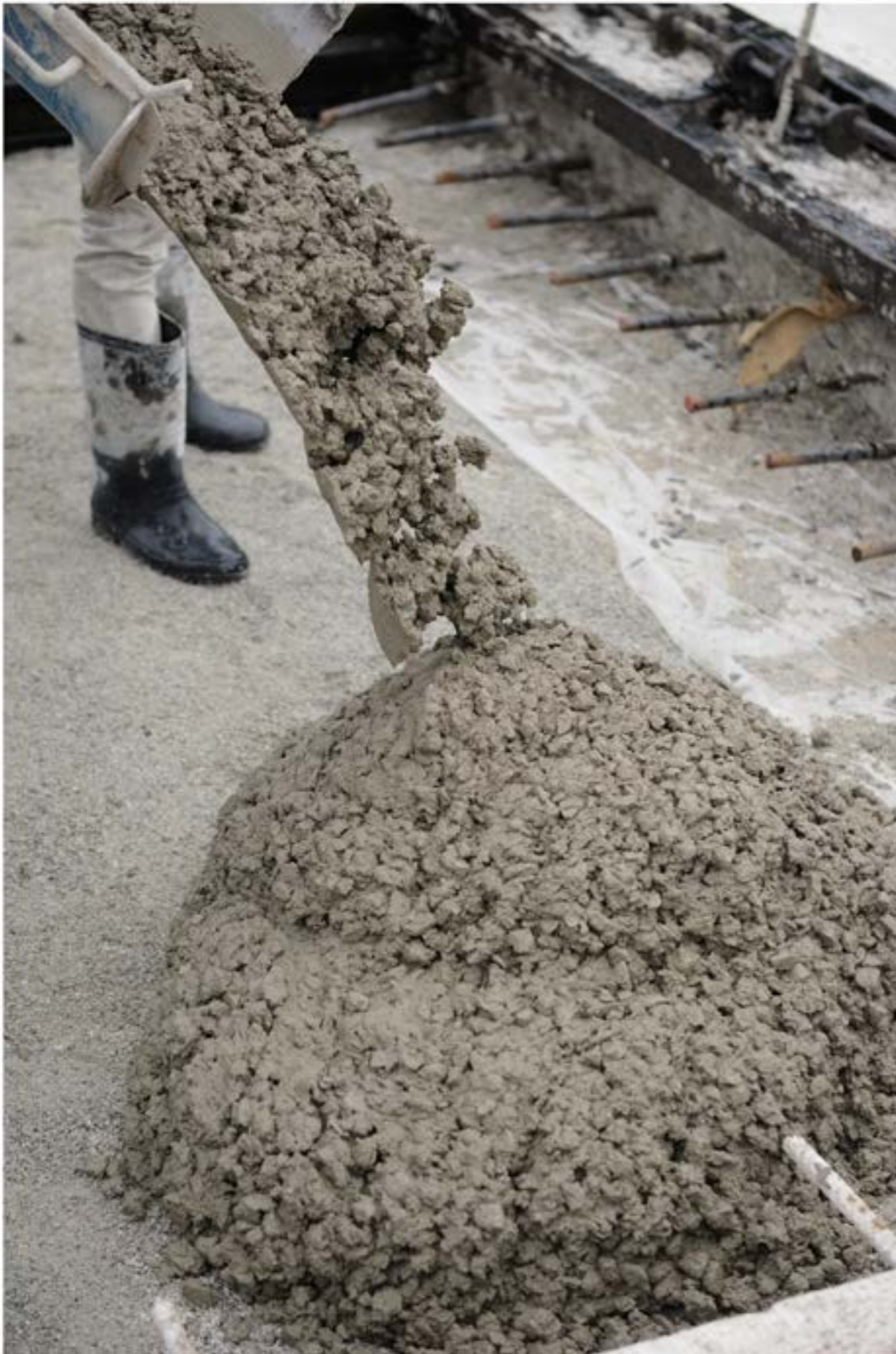
PERMEABLE CONCRETE ADDITIVE