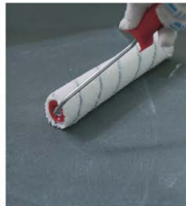
SEALER & ACRYLIC WATER-REPELLENT CURING MEMBRANE

The Sealer & Acrylic Water-Repellent Curing Membrane is a transparent, solvent free & eco-friendly water based product. It was developed to seal horizontal or vertical surfaces, as well as prefabricated pieces by penetrating the pores and providing water repelling qualities. Its active water-repelling ingredient reacts with the substrate. It's highly resistant to sunlight, outdoor conditions and alkalinity, which allows for its permanence through time. It adheres itself strongly to cement, stone or clay surfaces, it prevents fluorescence or saltpeter by protecting the superficial layer and increasing the sealers lifetime. When it's dry it produces a transparent, high durbaility film that does not turn yellow nor does dust adhere to it.